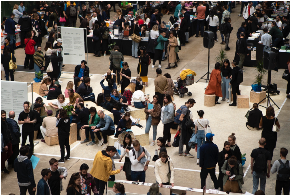
Photoworks X Offprint, Tate Modern, London, 2019