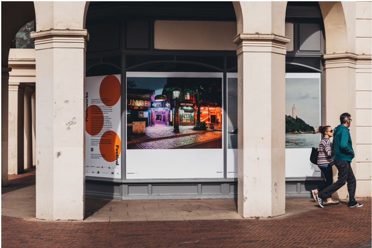
Roger Eberhard, Human Territoriality, Installation view, Photoworks Festival, Worthing, 2020