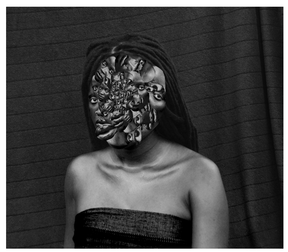
Lunga: © Lunga Ntila, Arising of Sanity, 2020