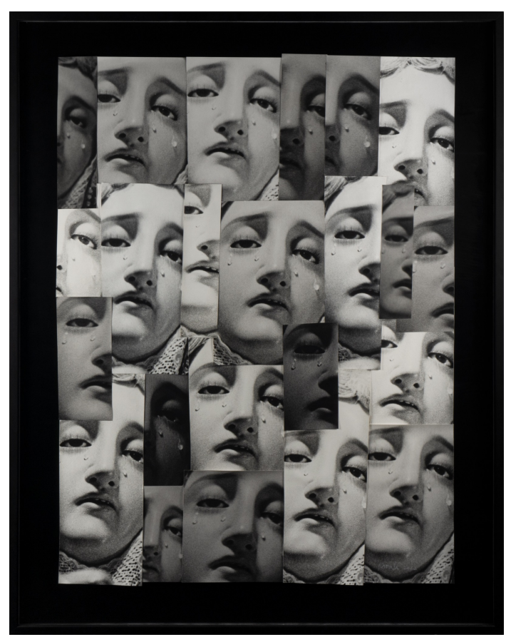
© Raena Abella, Faces of Grief, July 2024

Reproduction, in 1935. But since then, the implications of photography's reproducibility have been largely ignored - and even deliberately suppressed in limited edition fine art prints. That is, until now. The invention of digital imaging, the internet, and social media have brought the ability to reproduce and circulate images to the fore, and with them new questions around what it all means. Michelle Henning's Photography: The Unfettered Image and Andrew Dewdney's Forget Photography propose images as part of a flow, while developments in AI suggest attempts to create order from chaos.